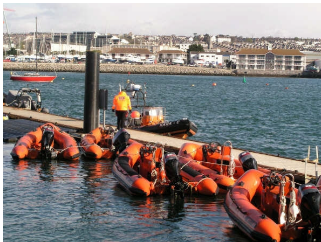
The Kara C ready for the off

The Rosehill is flat and upside down, but with 15+ metres viz we could see it all, large conger in the boilers & Mick caught a very pregnant lobby by the anchors. (He did let it go!!). 40 minutes fly by and soon we are racing back. Blue sky, flat calm but a biting cold wind. Quick discussion and the Elk was to be the afternoon dive back on the boat for 1.30 p.m.