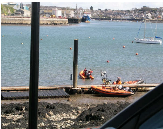
The Tide went out a bit too far!!

Day 2. We wake up to another day of blue sky. Down for a full English and out of the door into a mini blizzard. It soon stops and we're down at the boat, we have 2 companions for the 1st dive which was the Persier, flat calm sea again and we're soon there. Still good viz and plenty of under water pornography from the fish life, they're at it like rabbits.